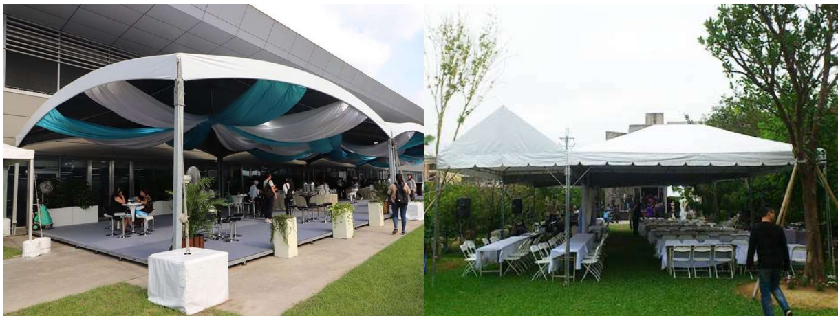
Lounge Area A & B

The Organizer reserves the right, in case of absolute necessity, to make essential layout adjustment, depends on exhibit situation and demand, with no obligation to provide compensation to Exhibitors/Sponsors.